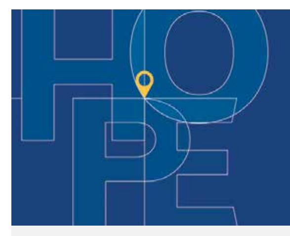
HopeBuilders Livestream May 13, 2021