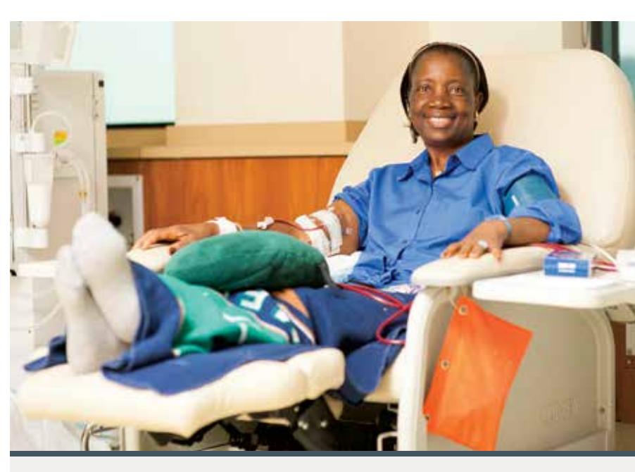
Chairs contribute greatly to comfort during treatment, but they do wear out.