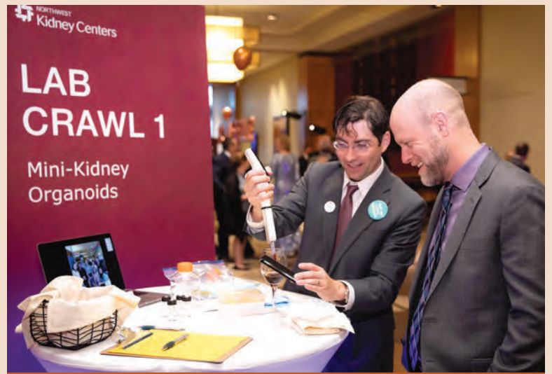
Gala guests could chat with Kidney Research Institute scientists about promising studies.

Thanks to all who helped raise $864,000 for research