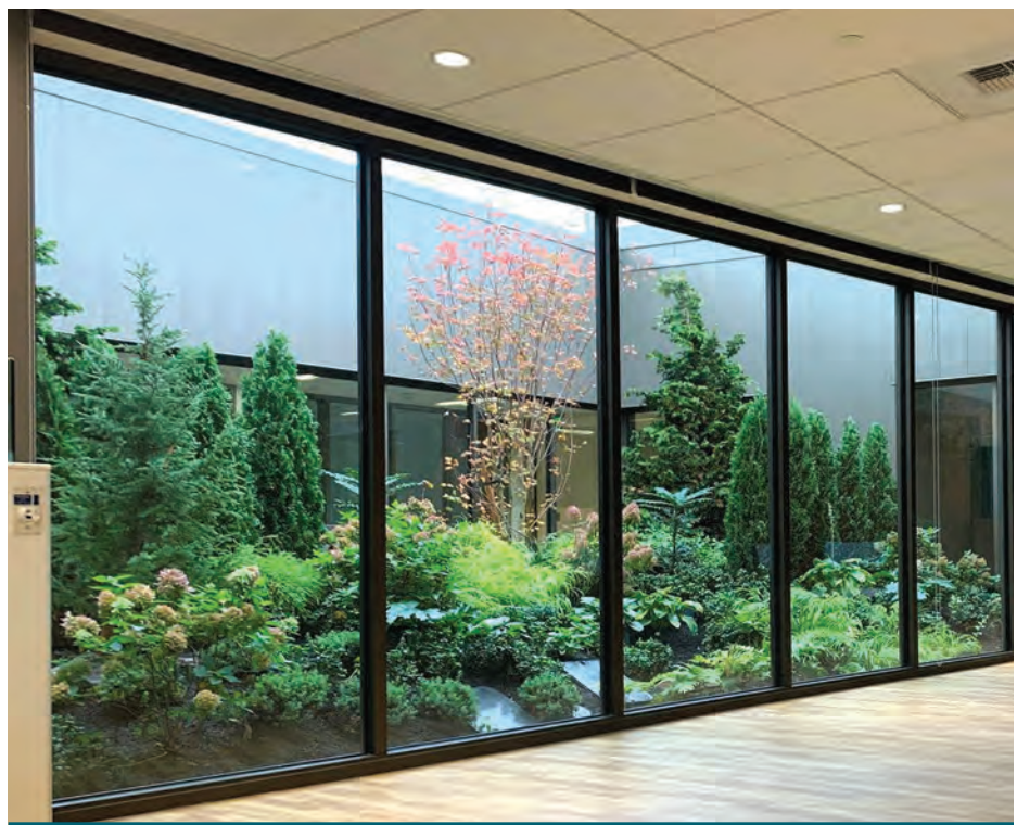
Rainier Beach patients look out to landscaped courtyards.

The 12,000-square-foot building meets LEED Silver standards for environmental friendliness, energy efficiency and sustainability.