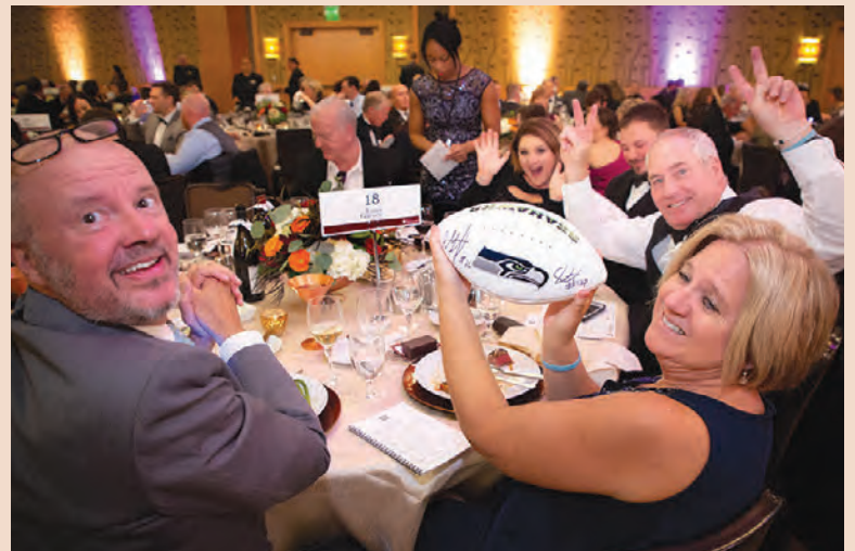
Coming together to support kidney research adds to the fun and excitement of the evening.

Join us Oct. 17, 2020 for the Discovery Gala at a new location: Hyatt Regency Seattle